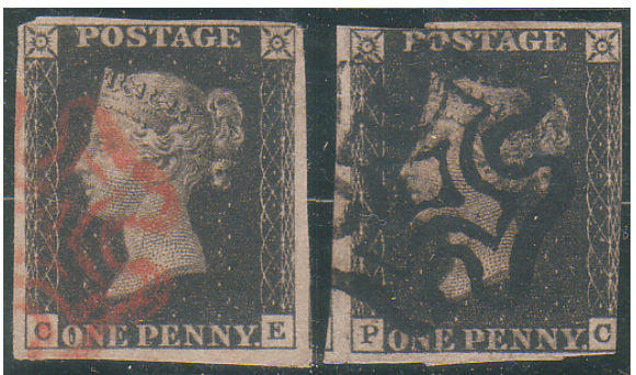
Red Maltese Cross Cancel

The Penny Black, celebrated as the world's first adhesive postage stamp, was issued along with the Tuppenny Blue in May 1840 as the culmination of a long campaign for postal reform led by Sir Rowland Hill.