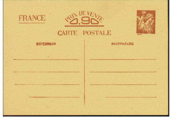
Prepaid Postcard with (non-denominational) "Iris" stamp

Within each zone, the domestic mail service continued as